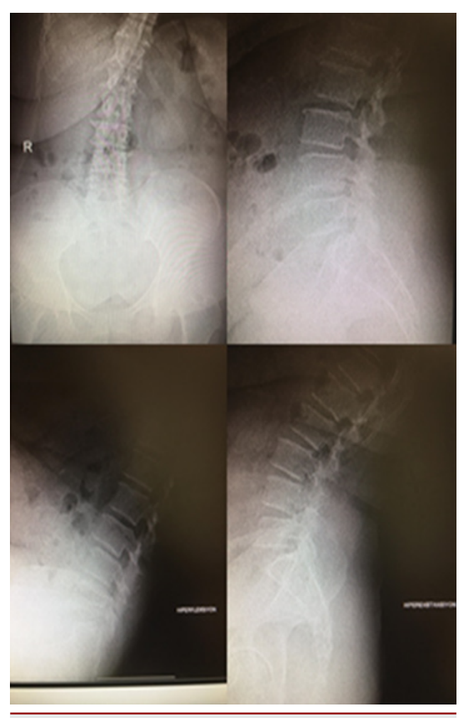
Figure-1. Preoperative roentgenogram

All cases were mobilized in same day postoperatively using steel underwire lumbosacral corset. Control assessments were done by direct graphies on the postoperative 1<sup>st</sup> day (Figure-4).