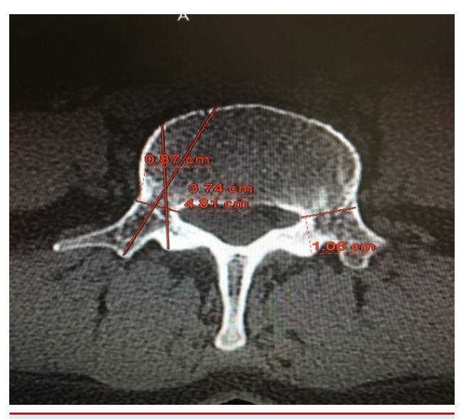
Figure-2. Corpus length and pedicle diameters were calculated in preoperative Lomber CTs