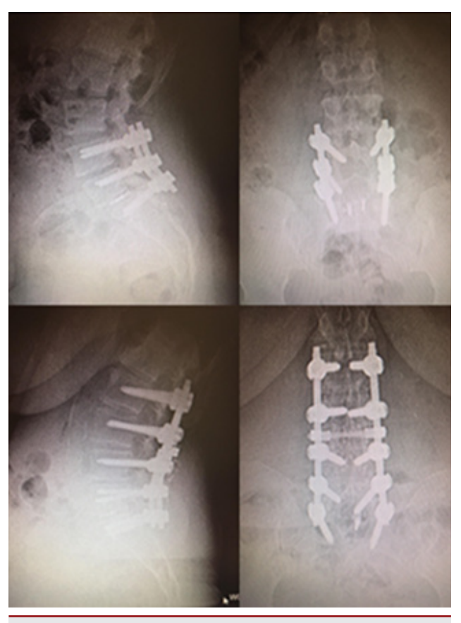
Figure-4. Control radiological images in two patients at postoperative 1<sup>st</sup> day.

cases had grade I, 8 had grade II spondylolisthesis according to the Meyerding classification (Table-3).