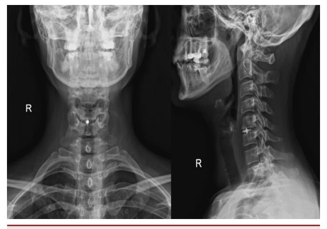
Figure-2. Postoperative antero-posterior and lateral plain X-ray at 12 months presenting the implant