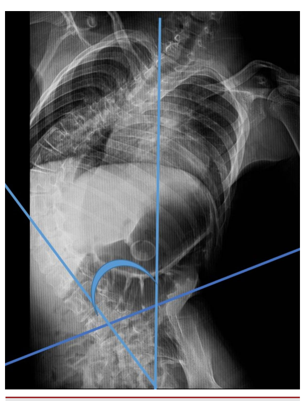
Figure-1. Measurement of pelvic obliquity by Maloney's method

Radiography was taken while standing if possible, or sitting if necessary, with AP and lateral investigations. Cobb angle, thoracic kyphosis angle and lumbar lordosis angle were measured with the Cobb method and recorded. The study by Shrader et al. determined the most reliable technique in terms of intraobserver and interobserver assessment was the Maloney method for measurement of pelvic obliquity, so in our study the Maloney method was used for measurements taking Shrader et al. as reference <sup>(16, 21)</sup>. With this technique, the angle between the line determined perpendicular to the horizontal line joining the iliac crests and the line drawn between T1 and S1 is measured <sup>(21)</sup> (Figure-1).