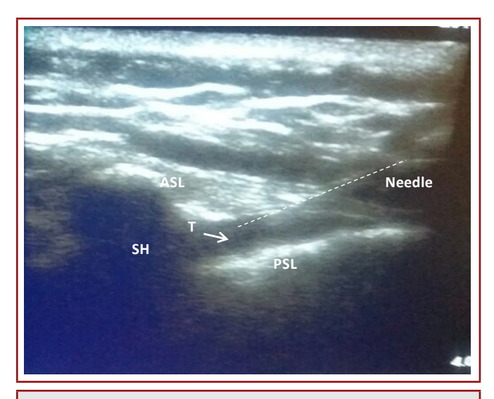
Figure 3. Proper needle placement and turbulence of the injected material in the sacral canal under ultrasound guidance SH: Sacral hiatus, T: Turbulence ASL: Anterior sacrococcygeal ligament, PSL: Posterior sacrococcygeal ligament

was placed for monitoring. Patients were observed for one hour after the injection in the pain clinic and adverse reactions were assessed. NRS scores were recorded and monitored for one month for both pain scores and unexpected complications.