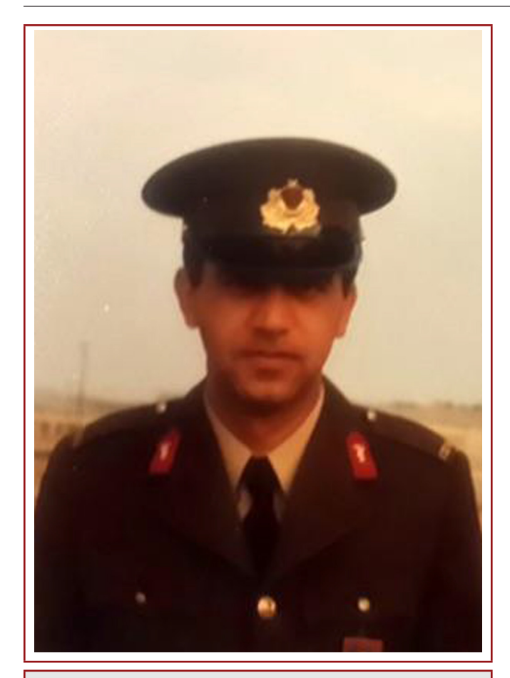
Figure-5. Kayseri Military Hospital in 1983