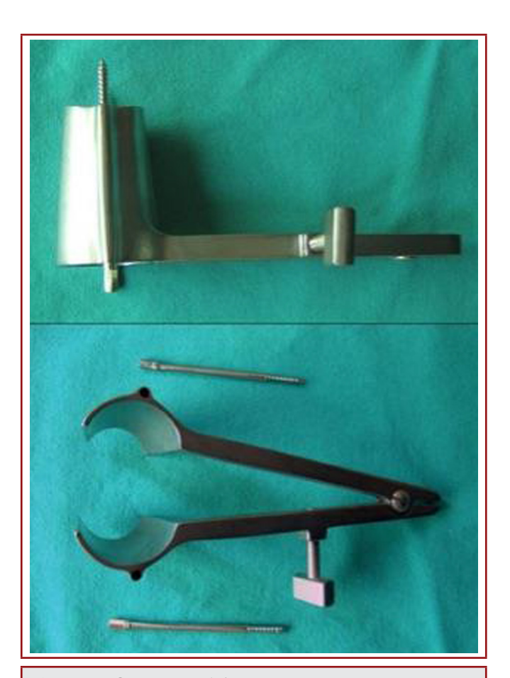
Figure-8. Ozer cervical disc retractor

Dr. Fahir Özer spread out the use of dynamic stabilization. He identified the indications of using dynamic stabilization. He classified the dynamic systems. And he created a suitable algorithm for the treatment of lumbar disc herniation<sup>16</sup>.