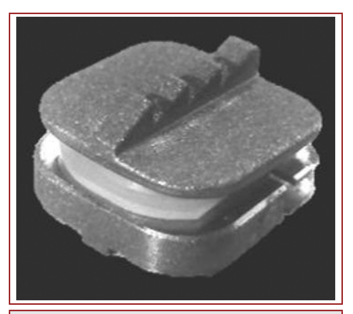
Figure-9. Alfa-D cervical disc prosthesis