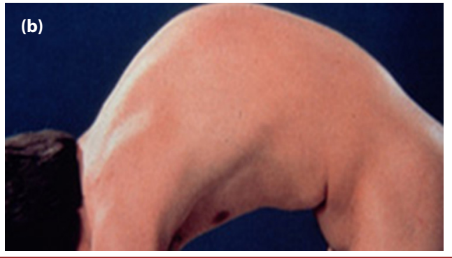
Figure-1. a. Lateral view of the patient and b. Adams test