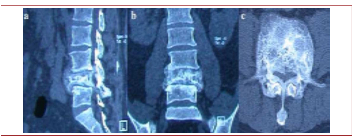
Figure-1. MRI showing rough trabecular pattern on the corpus and the posterior components of the L4 vertebra.