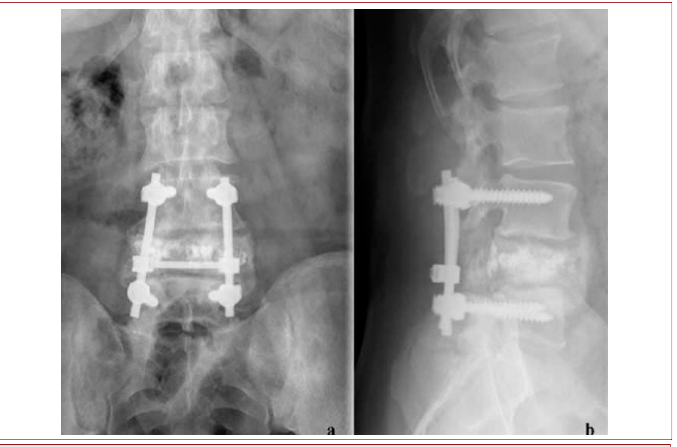
Figure-2. Posterior pedicle screw fixation with distraction between the L3–5 levels and vertebroplasty at the L4 vertebra.

Figure-1. MRI showing rough trabecular pattern on the corpus and the posterior components of the L4 vertebra.