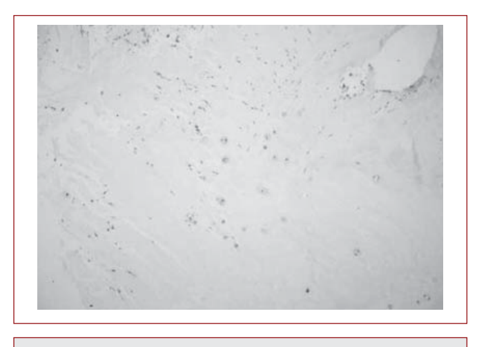
Figure-3. Histopathological findings of the surgical specimen showing degenerated fibrocartilage.

Most of the reported cases have involved the lumbar region, and a few cases with cauda equina syndrome have been described<sup>1,5</sup>. MRI, especially with contrast administration, appears to be the method of choice for diagnosis. Sequestered fragments usually show high signal intensity in T2-weighted images (80%) and low signal intensity in T1-weighted images, relative to the degenerated disc<sup>7,9,10</sup>. The high signal intensity in T2-weighted images can be explained by either the herniated material having a higher water content than an intact disc, or a reparative process leading to a transient water gain<sup>9,10</sup>.