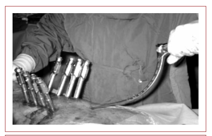
Figure-1. The placement of the rod by a cephalic way, eight screw lengtheners can be observed.

The patients in the OPSG received the routine open pedicle screw instrumentation technique, including the bone grafting procedure and appropriate BAER procedures, when necessary, under antibiotic prophylaxis. While all the patients in the OPSG were protected with a brace for 6 and 8 weeks postoperatively, no brace was used for stabilization for most of the patients in the PPSG.