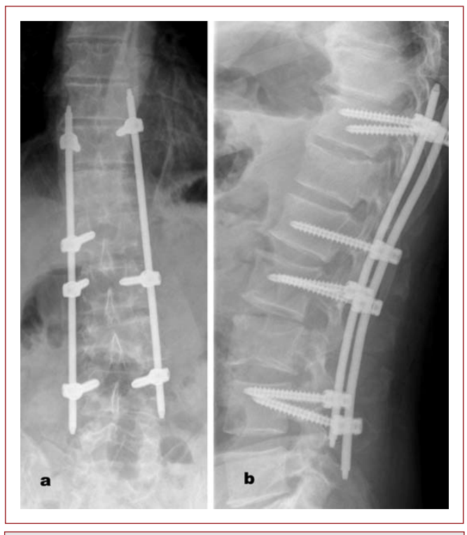
Figure-4.a-b. The view of long percutaneous screw instrumentation performed for T12 and L3 fractures (T11-L4). Seven screws in total were placed into the pedicles.

In the OPSG, on the other hand, while a fixed Cobb angle was observed for two patients, a worsening Cobb angle was detected for 16 patients, of which 13 had less than 10° of worsening and three had 10–15° of worsening. The reasons for Cobb angle worsening were analyzed radiographically, and it was detected that the worsening in the PPSG was due to an increased angle in the screw-rod joint for three patients, the migration of lower screws for one patient, and the pull-out of the upper screws for one patient.