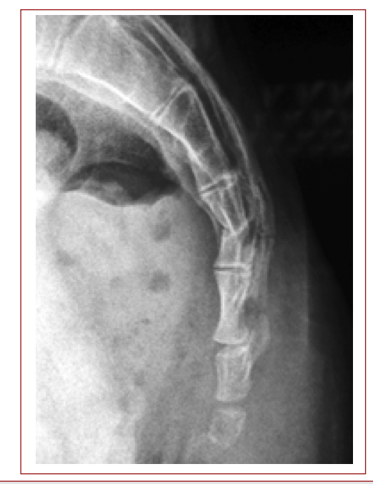
Figure-2. Suspicious fracture at the S4 vertebra.