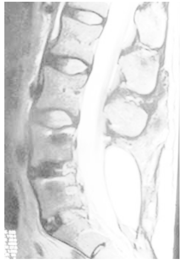
Figure 1. T2 weigthed sagittal image of the lumbosacral junction. Fluid collection behind the dura.

pain, right worse than left. She originally underwent L4 to S1 decompression with posterior lumbar interbody fusion, posterolateral fusion and instrumentation at another clinic in August of 2002. Initial diagnosis was degenerative disc disease with spinal stenosis at L4-5 and L5-S1. According to her operative note rhBMP-2 (INFU-SE, Medtronic Sofamor-Danek) was used for both interbody fusion and posterolateral fusion. During the PLIF procedure, the right side allograft (Tangent Medtronic Sofamor-Danek) was placed first with subsequent placement of milled autografts and rhBMP-2 on the left side. Postoperatively, because of worsening right extremity dysesthesias, a new MRI and CT scan (February 2003) were obtained. These studies demonstrated a fluid collection at the laminectomy site (Fig 1). This was thought to be a CSF leak,