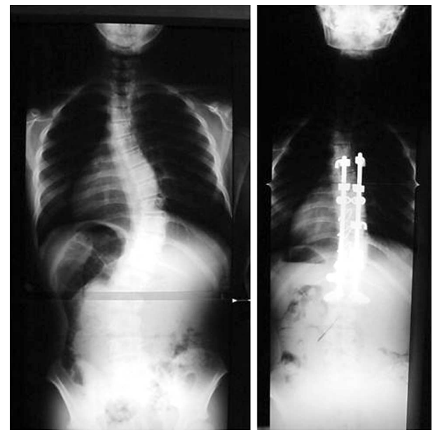
Figure 2: Twelve year old female with a thoracic scoliosis King type II preoperative (a) and postoperative (b) radiographs were shown. The correction was achieved by Isola sublaminar wire technique.