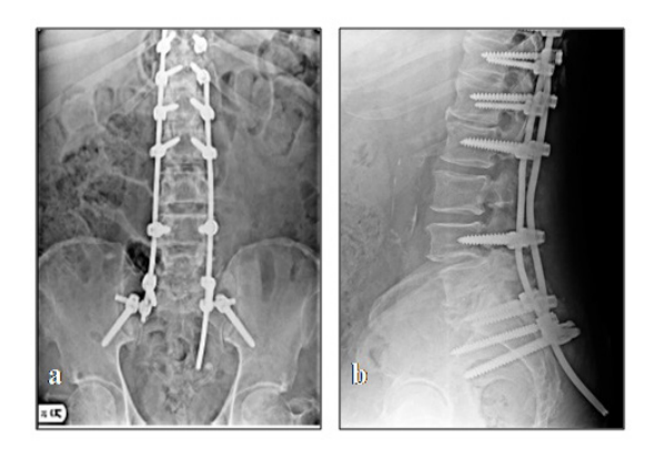
Figure 3. Post-operative X-rays AP (a) and Lateral (b) subsequent sequential failure of fixation with rod migration. AP: Anteroposterior

This type of implant failure may be secondary to several reasons: technique related, implant design defects, patient related factors and material failure with or without a non-rigid fixation (pseudoarthrosis). Poor technique in the form of insufficient tightening of the nut into the screw head, or improper coupling