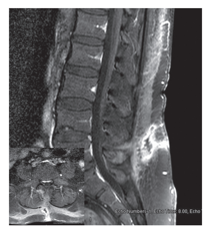
Figure 1. The figure shows a superficial SSI in the T1-weighted contrast MRI of a patient who underwent L5-S1 discectomy SSI: Surgical site infection, MRI: Magnetic resonance imaging

Nominal data are presented as percentages while numerical data are presented as average and standard deviation. Comparison between groups was done using the chi-square and Fisher's exact test depending on the number of group subjects for nominal data, Kruskal-Wallis and Mann-Whitney U tests for