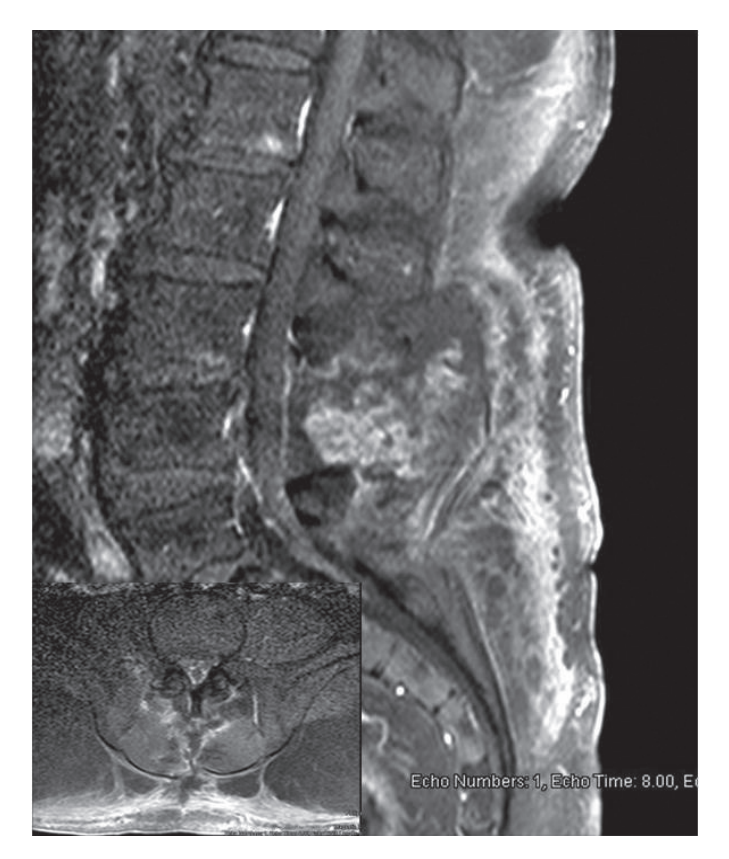
Figure 2. The figure shows a deep SSI in the T1-weighted contrast MRI of a patient who underwent L4-5 discectomy SSI: Surgical site infection, MRI: Magnetic resonance imaging