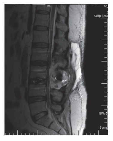
Figure 1. Dural leakage is observed in the T2 - weighted MRI - Sagittal Image

Dural injury incidence in a group of patients who underwent revision surgery was 25% and was not associated with the years of experience of the surgeon<sup>(16)</sup>. In our study, the ratio of dural injury in revision cases was found to be 25.86% (15/58). Dural injury is one of the most common complications in spinal surgery. Although different methods have been described for the treatment of this complex problem, the primary treatment