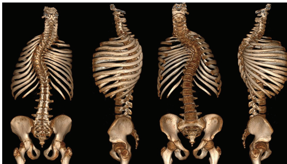
Figure 2. Three-dimensional image of the spine created by the surgeon with 3D volume rendering using axial tomography slices